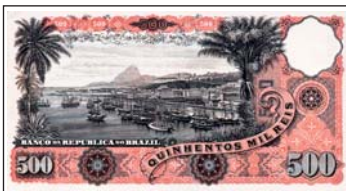
On the front of the banknote, a view from the port of Rio de Janeiro