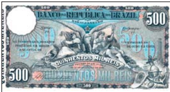
On the reverse of the banknote, the Justice and Navigation emblems